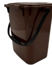
Bio bin 10 L Dimensions: 222 x 180 x 280 mm