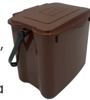
Bio bin 7 L Dimensions: 210 x 175 x 195 mm

Customization: A logo can be integrated into the lid. A four-color sticker or screen printing is also available, for example for sorting instructions.